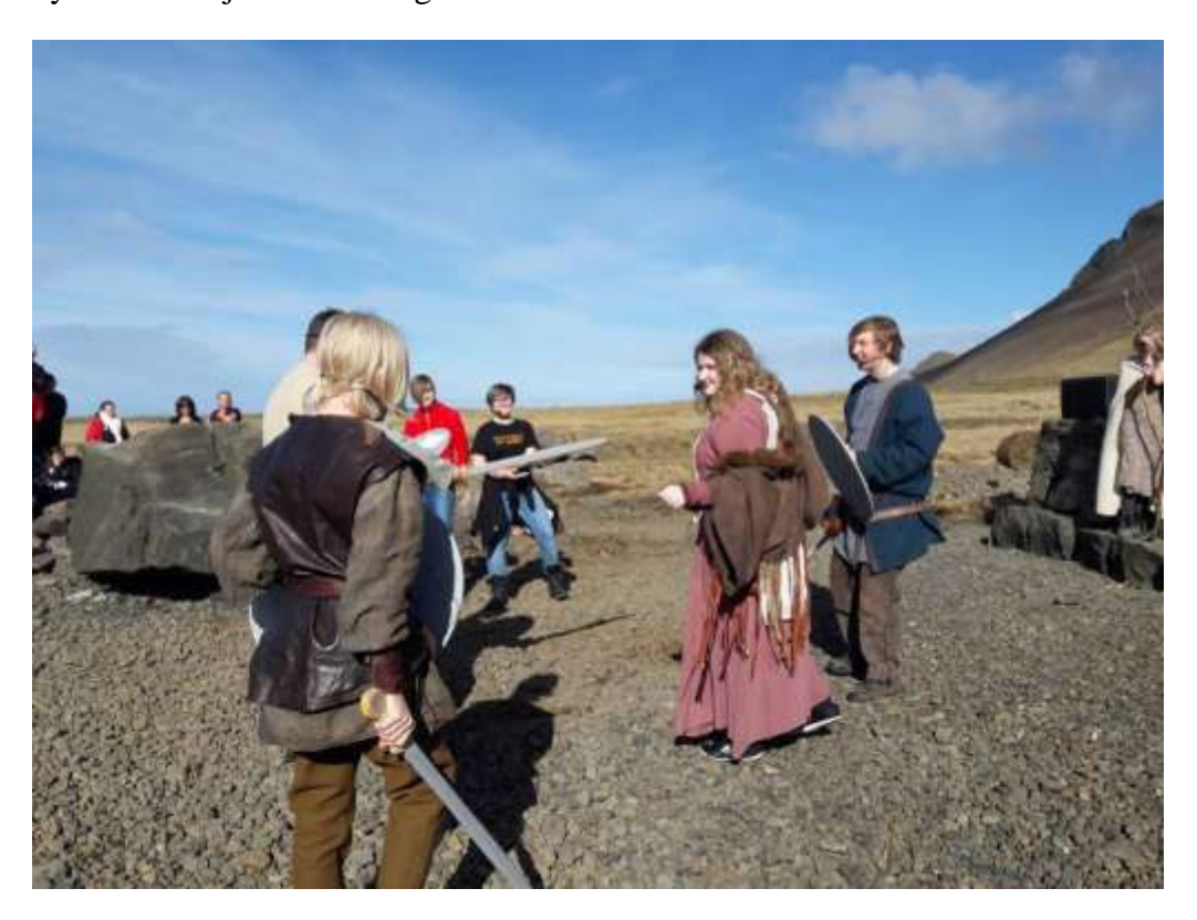
Children's cultural festival in April 2018. Students in the local elementary school, Klébergsskóli (6–16 years old), acting a part of Kjalnesinga saga : a battle between heathen men and Christians.