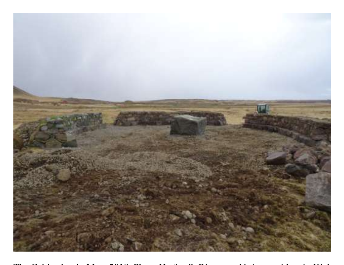
The Celtic altar in May, 2018.

The Celtic altar at Esjuberg in Kjalarnes, Iceland. Drawings and photos.