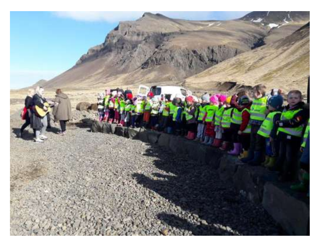
Children's cultural festival in April 2018. Children of the local Kindergarten singing a Celtic hymn. Mt. Esja in the background.