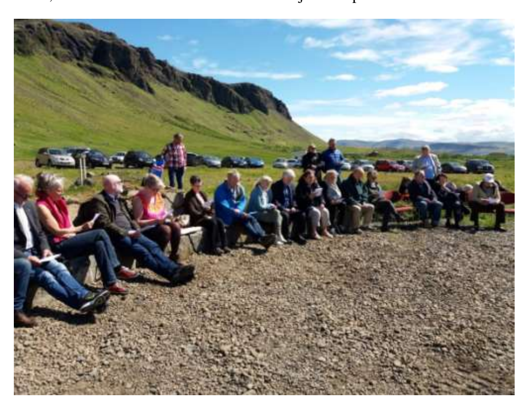
A service at the Celtic altar in June 2017.